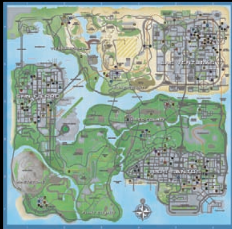
SAN ANDREAS | LOS SANTOS | SAN FIERRO | LAS VENTURAS

As one might imagine with a state as enormous as San Andreas, the economy is a leviathan in itself. San Andreas' three major cities have a diverse range of what they contribute to the state's economy. For instance, Los Santos (Vinewood) continues to be a major world center for motion picture, television and other related entertainment industries. San Fierro is the shipping capital of the nation (if not the world), where hundreds of cargo laden ships enter and exit its bay every day. Last but not least, we have San Andreas' cash cow...Las Venturas. A place where millions of people flock to every year to gamble away their children's college fund, life savings, the house, and anything else to fuel their "leisure pursuit."